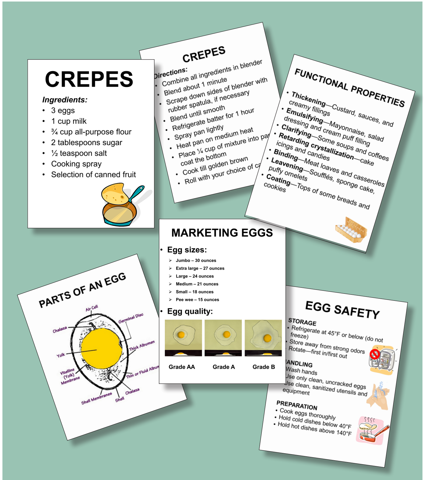
Figure 3. Demonstration poster examples.